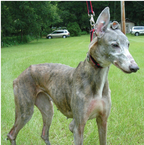
Holly, her first day off the farm at age 14...

Last October, GREAT's newsletter cover story was about Task Holly Day, our beautiful brindle girl with a crooked ear and clumsy gait, who found her first and forever family just shy of her 14 th birthday. Holly enjoyed 11 months of absolute love and adoration before her heart simply and quickly gave out. She passed away at home, in her Daddy's arms and with her Mommy by her side, on July 7, 2005. We knew her time on earth would not be long, but that did not prepare us for the sadness we felt when she was gone. She will always hold a special place in our hearts and the memories we have of her will always make us smile.