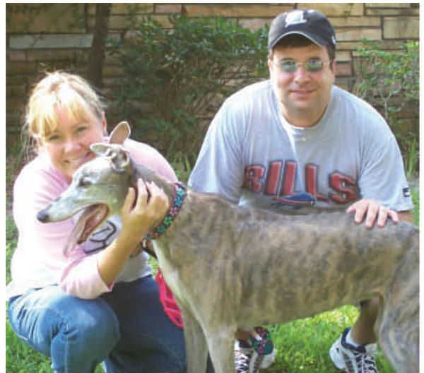
and with her parents - what a difference love made in her life.

Although our time with Holly was short and losing her was so very hard, I still believe in my heart that adopting a senior is one of the most wonderful and rewarding ways to bring sheer joy to your life and the life of a deserving greyhound. Just ask Elfie, who we adopted on September 4, 2005. She turns 12 in February.